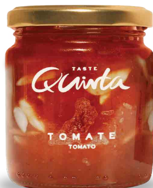
Tomato with Almond Jam 140g and 270g