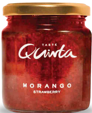
Strawberry Jam 130g and 250g