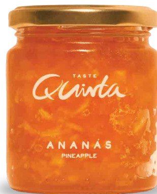
Pineapple Jam 140g and 260g