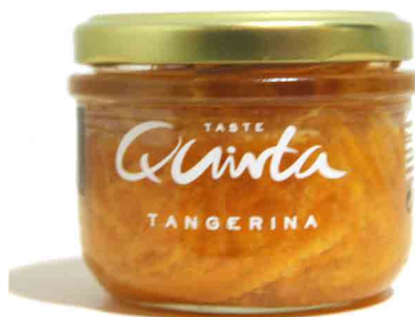
Tangerine Jam 150g