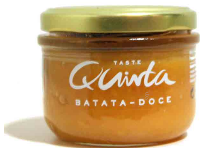
Sweet Potato Jam 150g