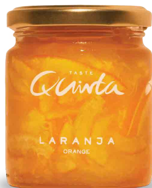
Orange Jam 150g and 270g