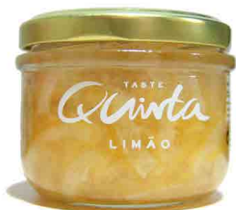
Lemon Jam 150g